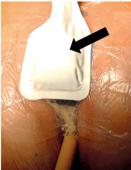
Figure 4. A vacuum pad (arrow) secured to the negative pressure wound dressing under continuous pressure of 100 mm Hg